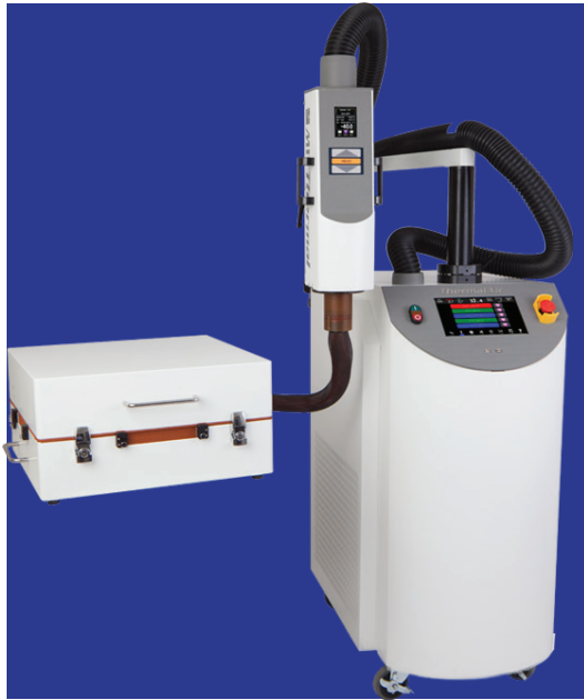
TA-5000A with Compact Chamber Clamshell