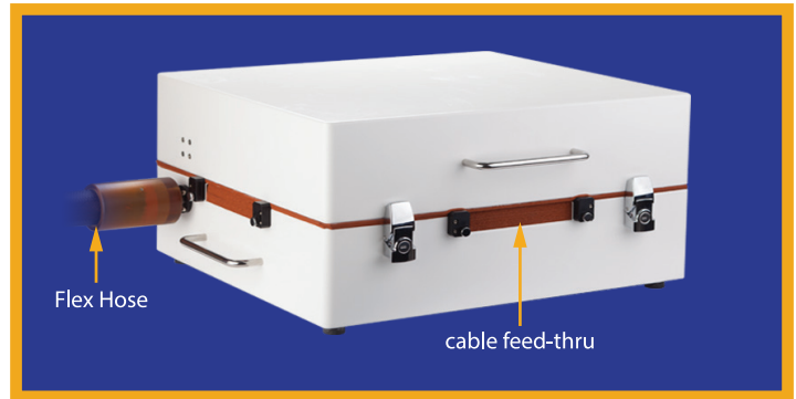
Compact Chamber Clamshell Model

Compact Chamber Clamshell Model Chamber 14Wx16Dx6.2H inches